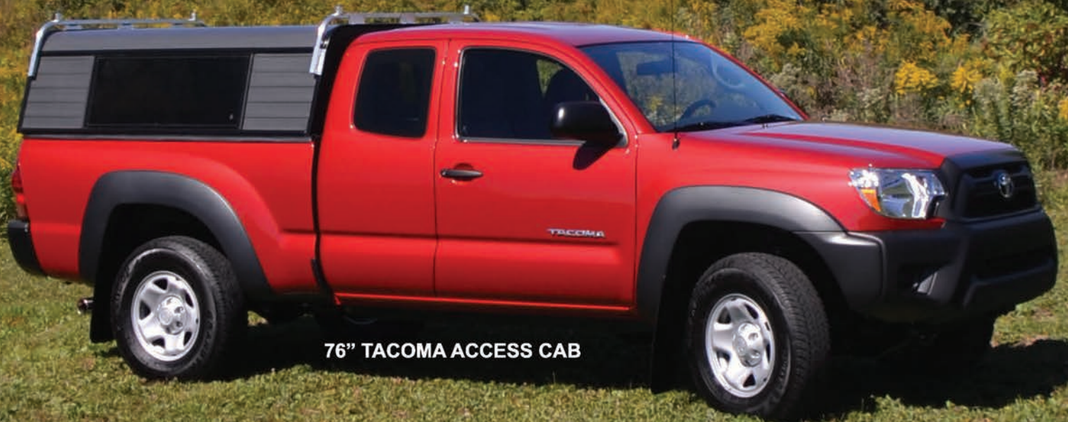
76" TACOMA ACCESS CAB

Jeraco has been manufacturing quality truck caps for more than 40 years, we are proud to carry on this tradition by offering to our customers a full line of aluminum covers built right here in Central Pennsylvania with a range of options to fit each customers needs.