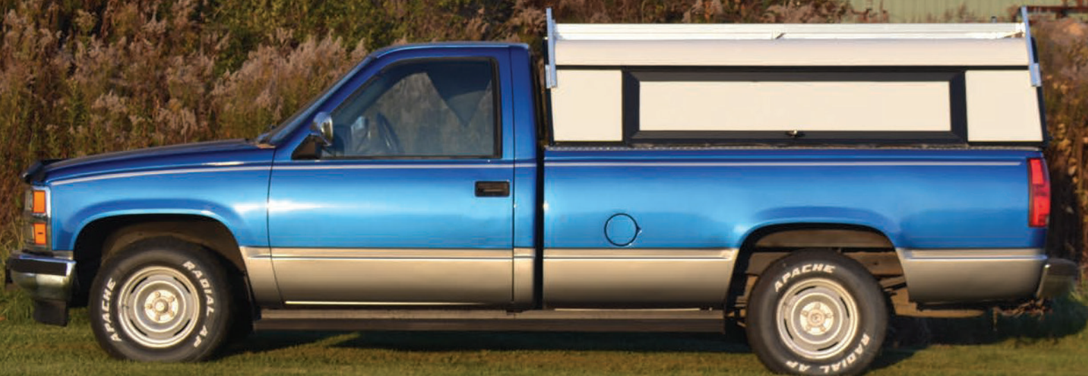
CHEVROLET REGULAR CAB 23" CONTRACTORS SERIES WITH 68" METAL COVERED SIDE DOORS AND A HEAVY DUTY LADDER RACK