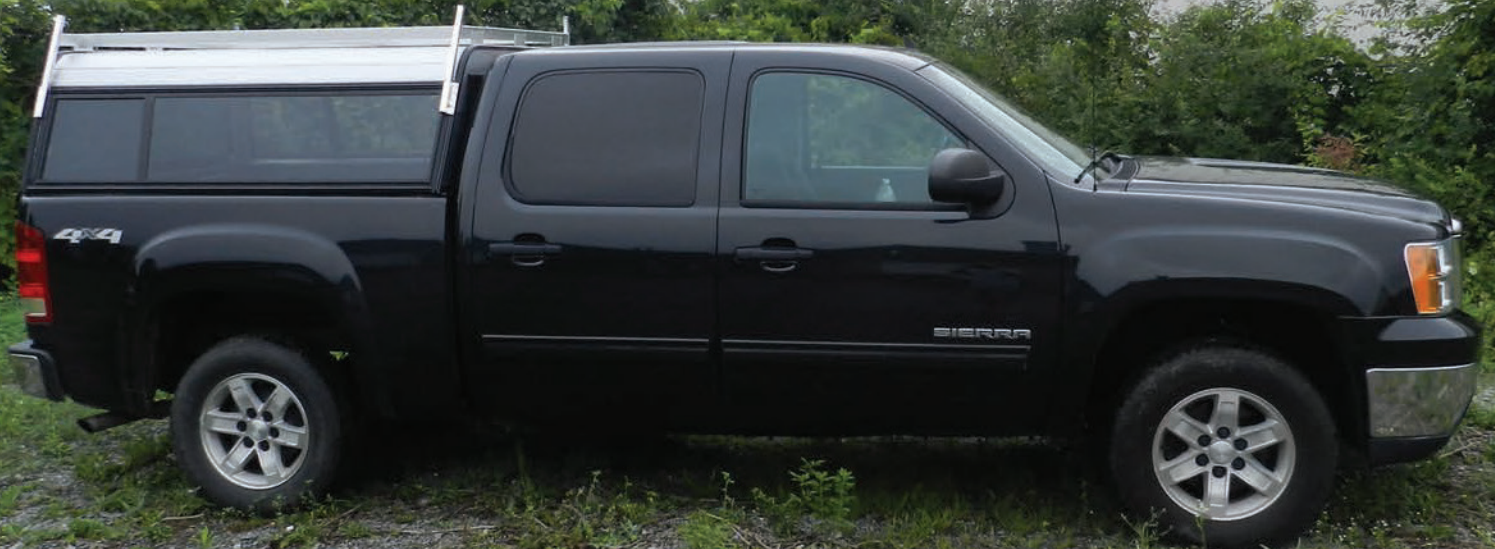
GMC SIERRA CREW CAB 23" CLASSIC ALUMINUM SERIES WITH 67" MITERED SIDE SLIDING WINDOWS AND A HEAVY DUTY LADDER RACK