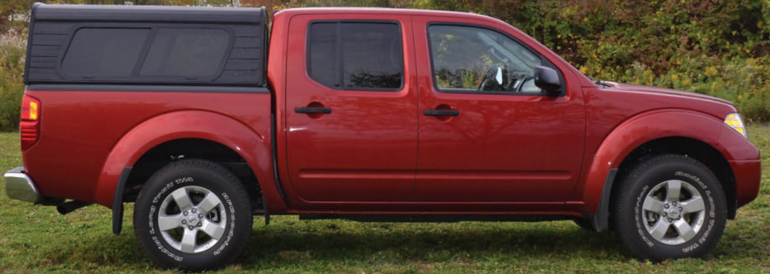
NISSAN FRONTIER CREW CAB 21" CLASSIC ALUMINUM SERIES WITH 44" RADIUS SIDE SLIDING WINDOWS