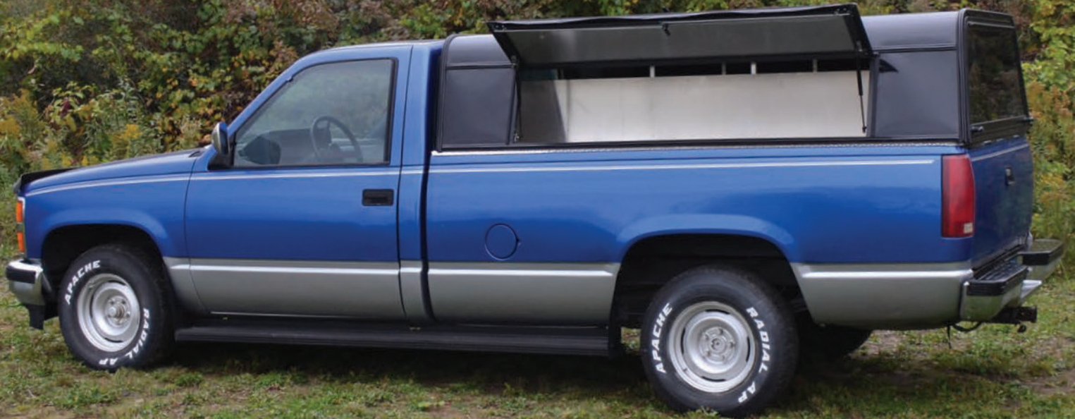
CHEVROLET REGULAR CAB 23" CONTRACTORS SERIES 68" METAL COVERED SIDE DOORS AND TOOL BINS