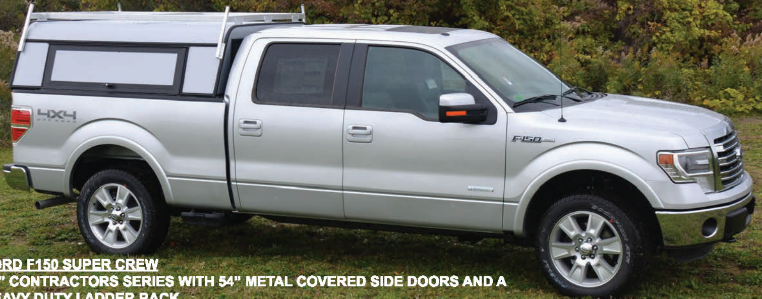
FORD F150 SUPER CREW 23" CONTRACTORS SERIES WITH 54" METAL COVERED SIDE DOORS AND A HEAVY DUTY LADDER RACK

An upgraded version of our Classic Aluminum Series our Contractors Series truck caps feature a heavy-duty aluminum welded frame, .030 smooth aluminum skin, metal covered side doors and tool bins. These caps are designed to be an economical yet dependable cover for years of use by contractors and other tradesmen.