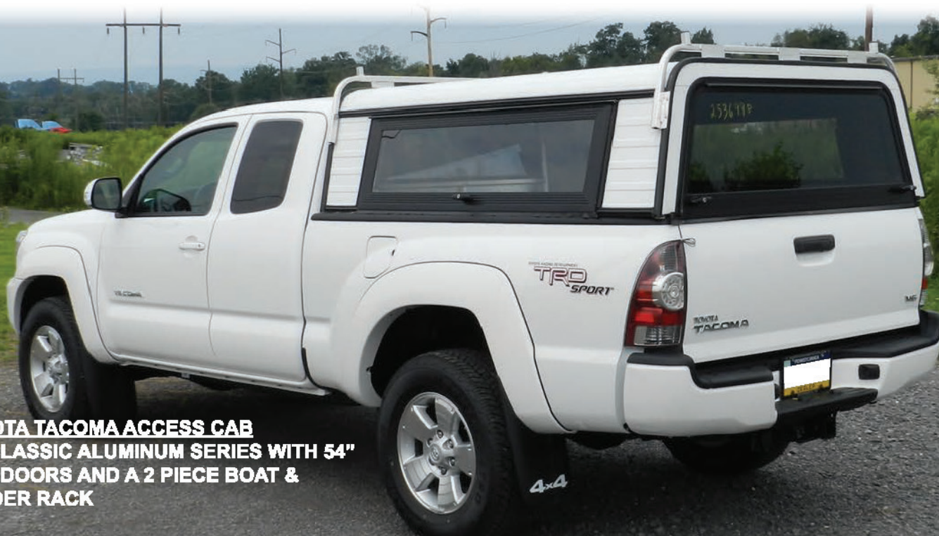
TOYOTA TACOMA ACCESS CAB 21" CLASSIC ALUMINUM SERIES WITH 54" SIDE DOORS AND A 2 PIECE BOAT & LADDER RACK