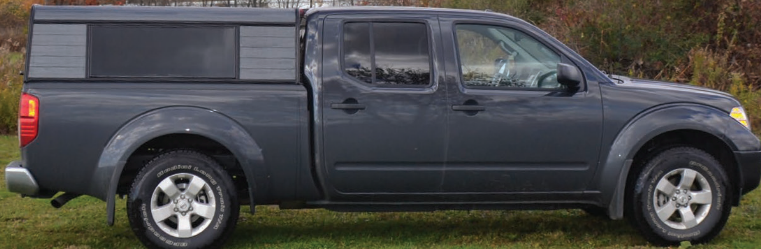
NISSAN FRONTIER CREW CAB 21" CLASSIC ALUMINUM SERIES WITH 40" AWNING WINDOWS

A time tested design in use for decades our Classic Aluminum Series caps are designed for the value minded customer who desires a lightweight and dependable cover for their truck. Whether your looking for a cap for your new truck, a cap just for the winter time or a cap for your companies pickup truck fleet, Jeraco is proud to offer a range of window styles and optional features to suit each of our customers needs.