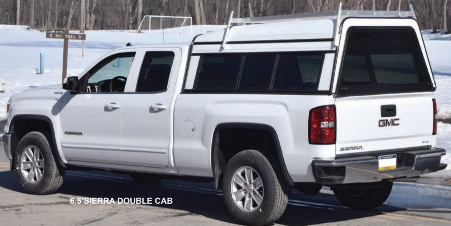
6.5' SIERRA DOUBLE CAB