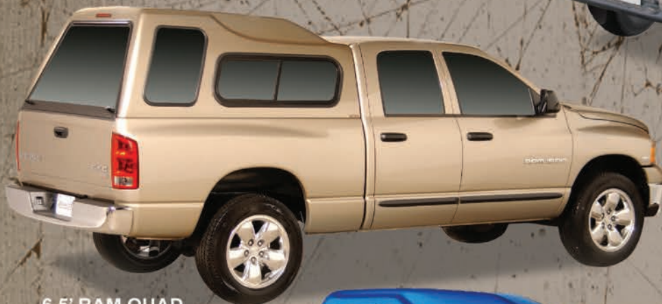
6.5' RAM QUAD CAB