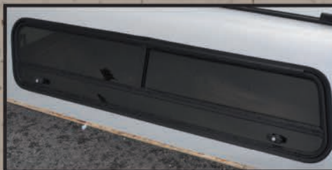
SIDE SLIDING ACCESS DOOR