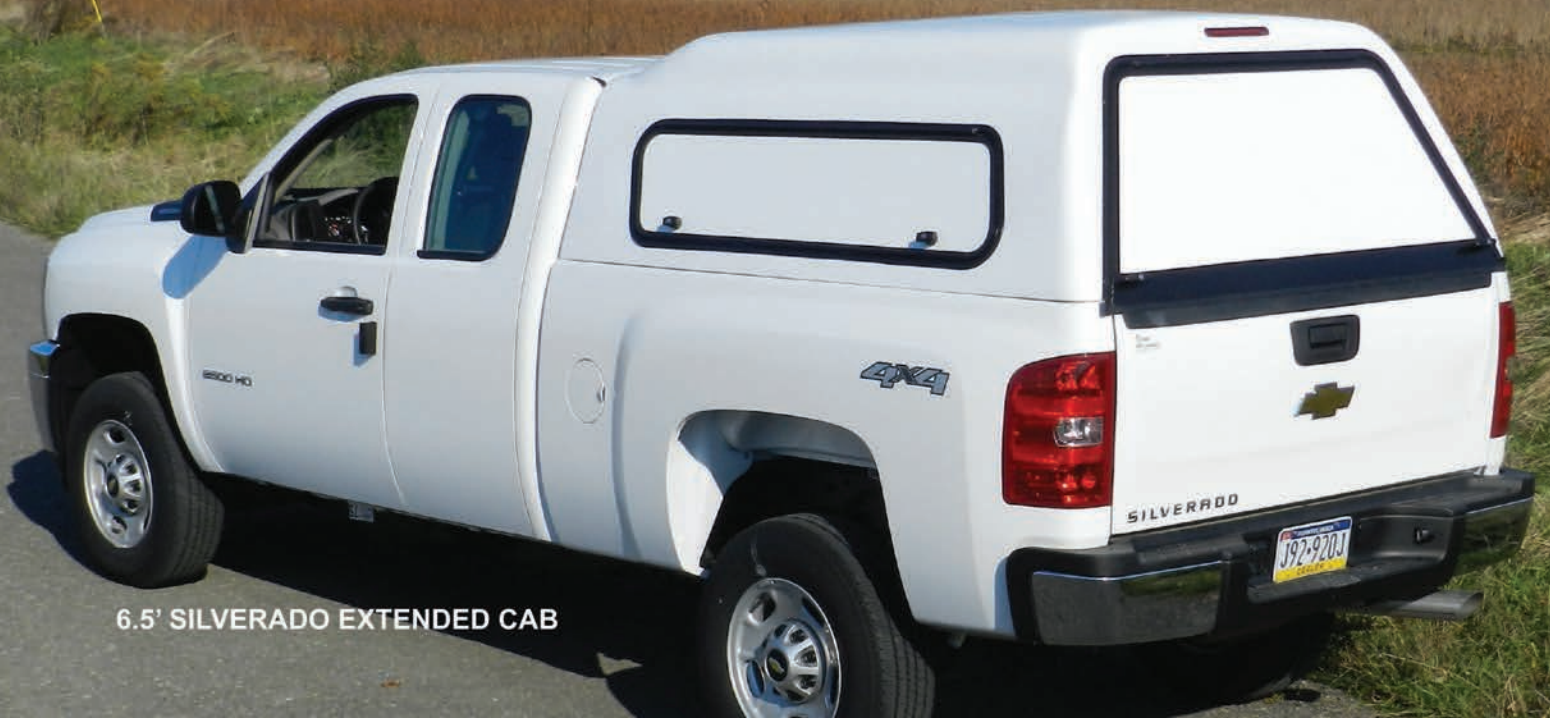
6.5' SILVERADO EXTENDED CAB