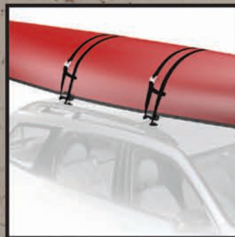
Yakima KeelOver Canoe Gunwale Brackets