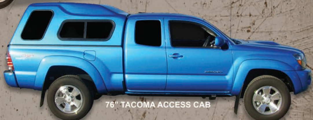
76" TACOMA ACCESS CAB