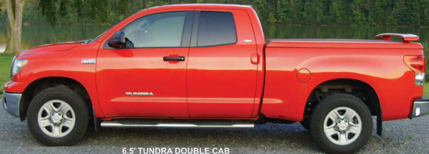
6.5' TUNDRA DOUBLE CAB