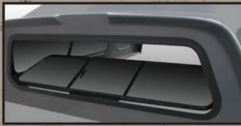
TILT DOWN FRONT SLIDING WINDOW