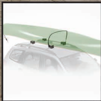
Yakima Foam Block Canoe Carrier

Yakima is the world's leading manufacturer of car racks, roof racks, bike racks, canoe and kayak racks, ski racks, and more. All Yakima Racks and Accessories are covered by a Limited Lifetime Warranty.