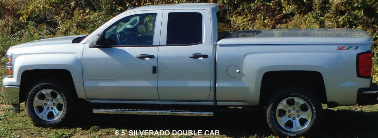
6.5' SILVERADO DOUBLE CAB