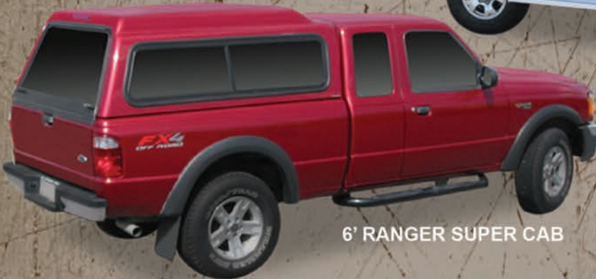
6' RANGER SUPER CAB