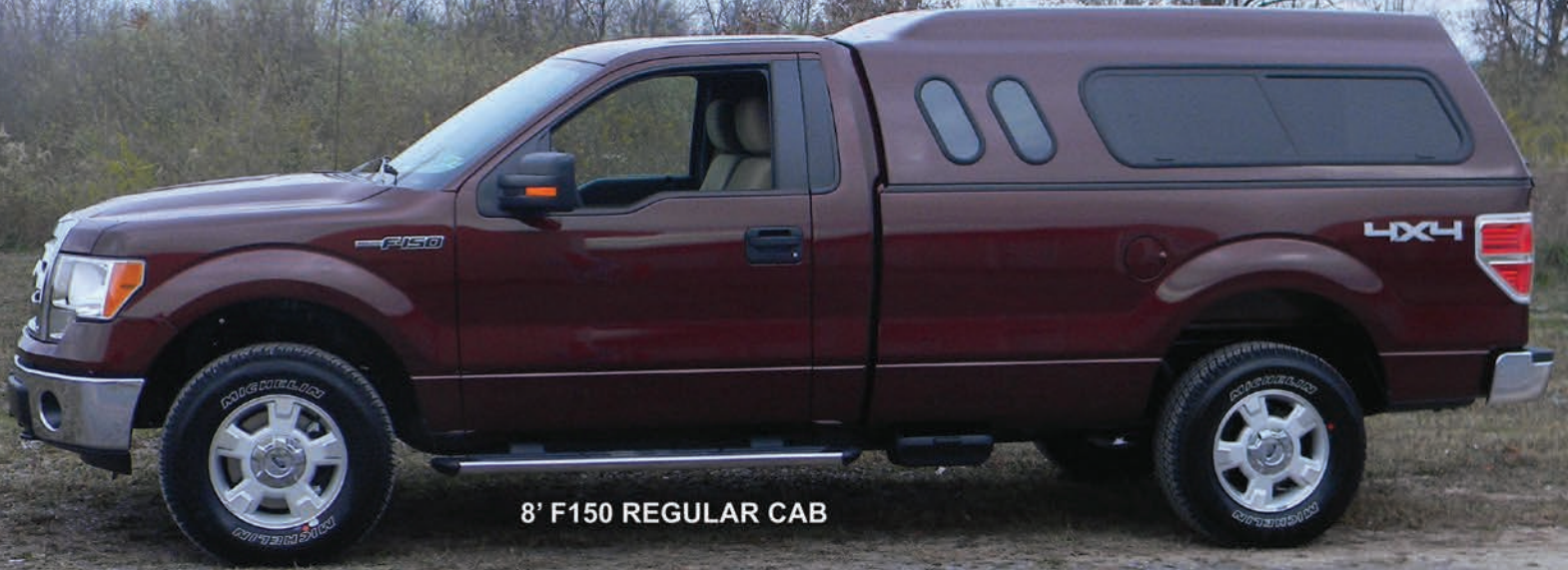
8' F150 REGULAR CAB