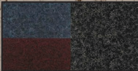
INTERIOR HEADLINER (ACTUAL LINER MAY DIFFER IN COLOR & APPEARANCE)