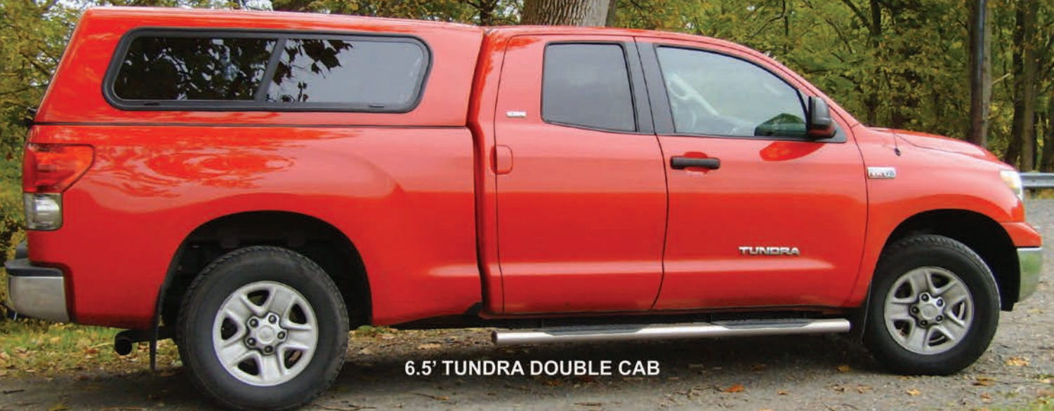
6.5' TUNDRA DOUBLE CAB