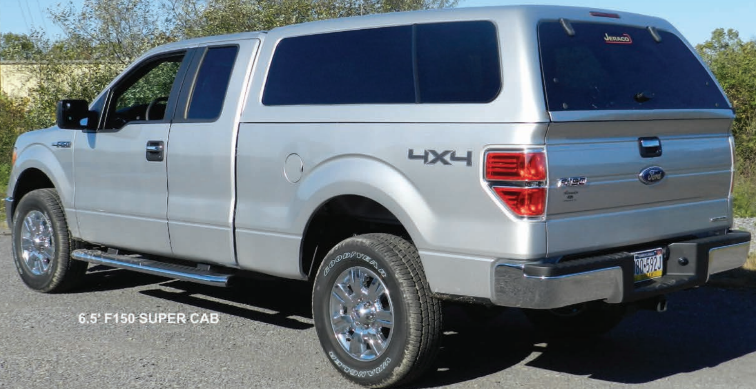
6.5' F150 SUPER CAB

With the Supreme Series Jeraco takes the Cab-High Series to a new level. With an all-glass rear door and contoured, flush-mount, vented side windows the Supreme Series offers truck owners all the aesthetics of a sport utility vehicle and all the convenience of a pickup. Whether you are taking a vacation to the beach, planning a country getaway or simply heading out to the grocery store the Jeraco Supreme Series is the perfect cap to fit your needs.