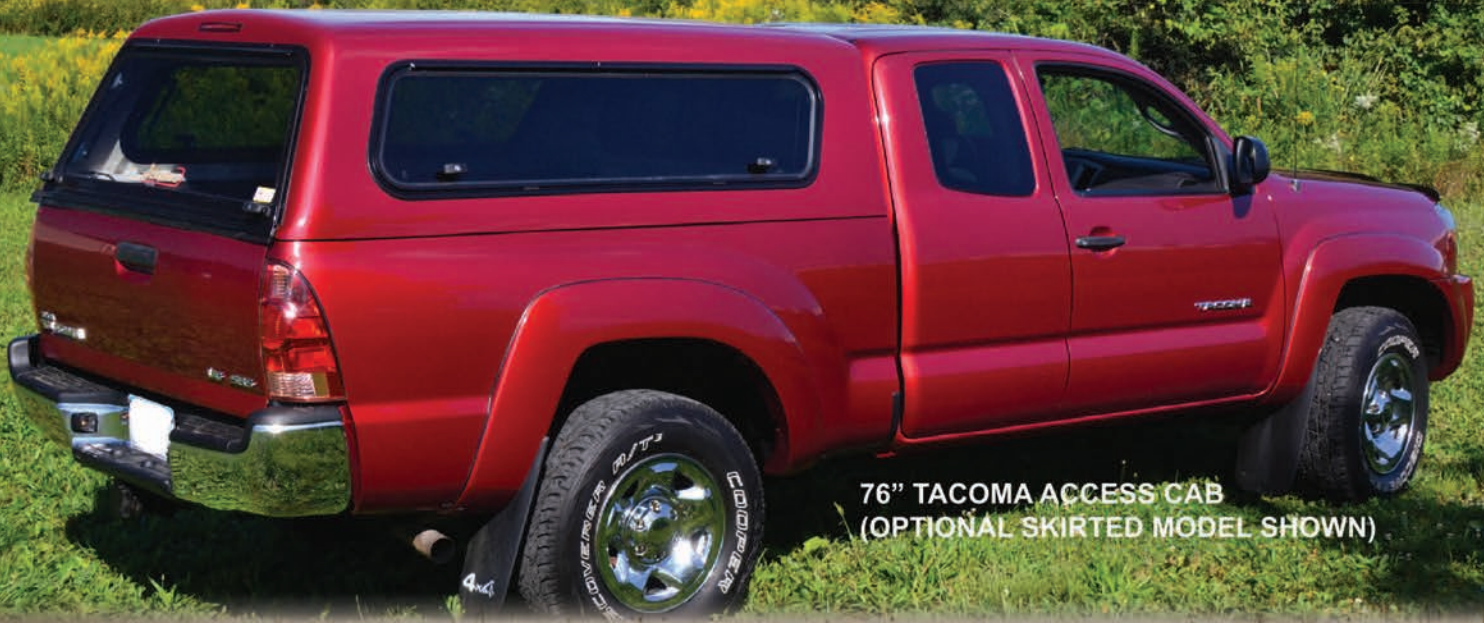
76" TACOMA ACCESS CAB (OPTIONAL SKIRTED MODEL SHOWN)