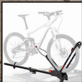
Yakima FrontLoader Upright Bike Rack