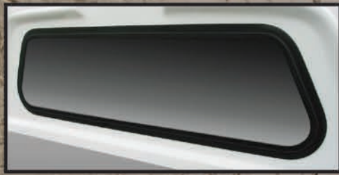
TILT DOWN FRONT PICTURE WINDOW