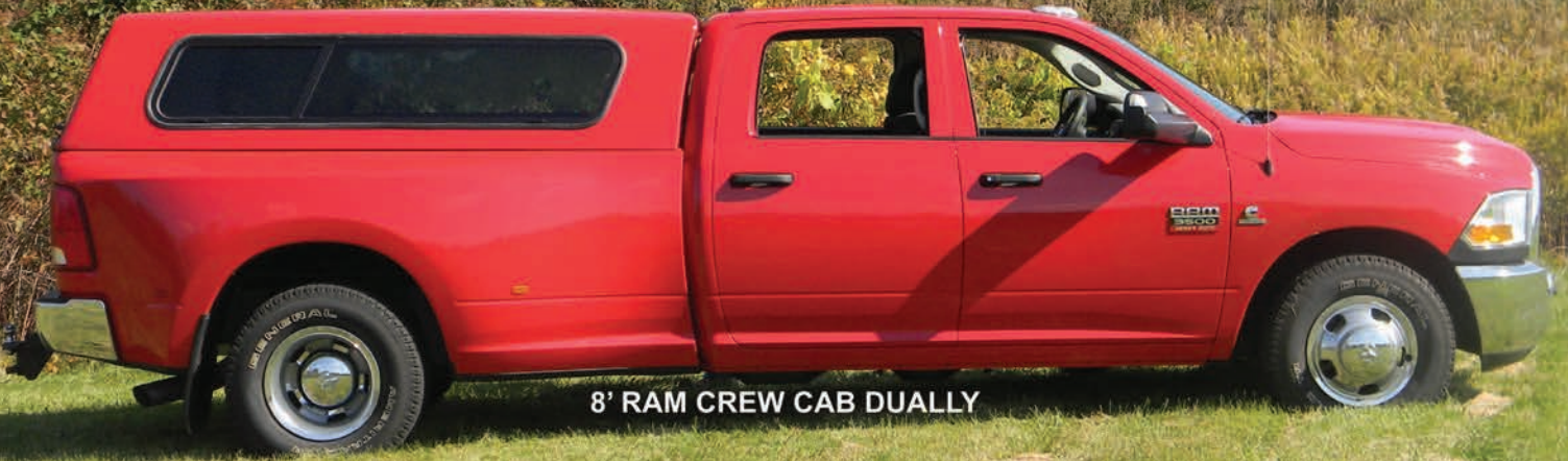
8' RAM CREW CAB DUALY