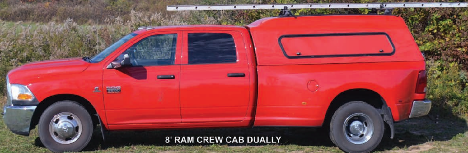
8' RAM CREW CAB DUALLY

At Jeraco we understand that our customers expect their trucks to work as hard as they do while still being the best looking truck at the construction site. With this in mind we're proud to offer to our customers multiple options to customize your truck cap for the way you work.