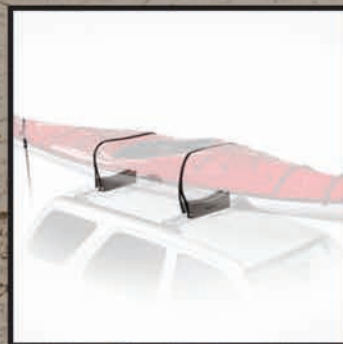
Yakima Foam Block Kayak Carrier