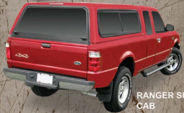
RANGER SUPER CAB