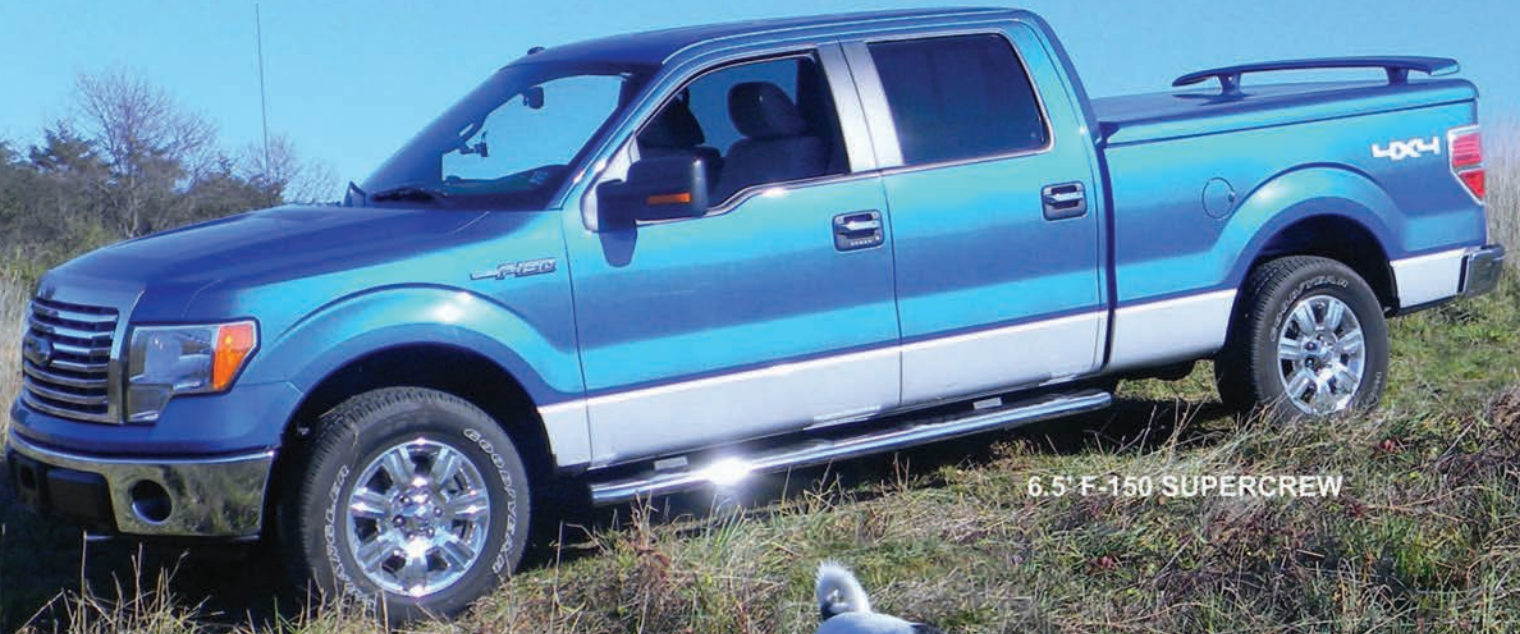
6.5' F-150 SUPERCREW

Jeraco has been manufacturing quality truck caps and providing the highest standard of service to every one of our customers for more than 40 years. All Jeraco Fiberglass covers are covered by a lifetime-limited warranty. Jeraco builds each cap using colors, window layouts, and options to suit your individual needs and tastes.