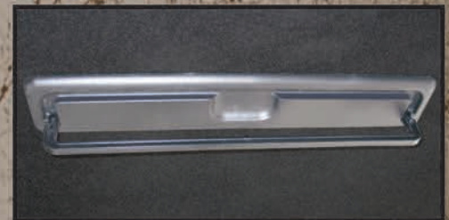
FOLDING PLASTIC CLOTHES RACK