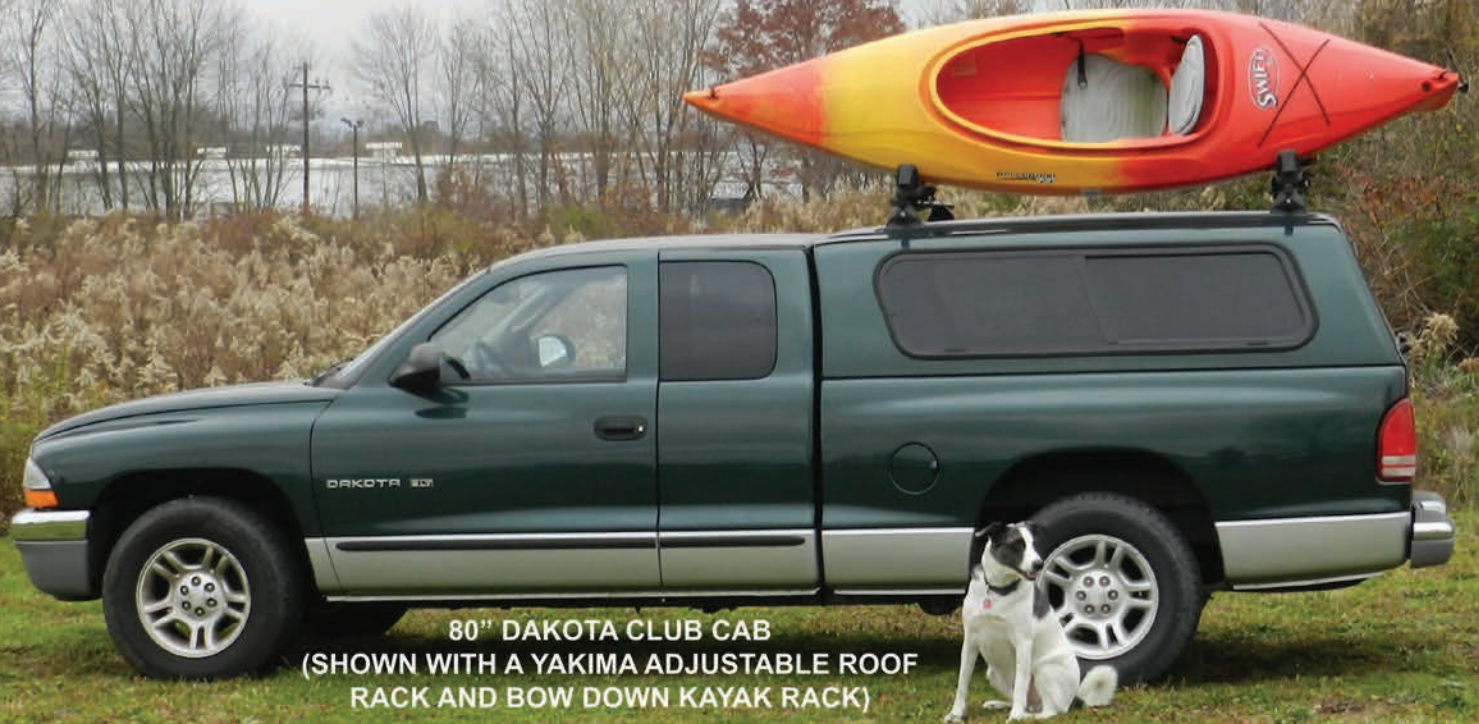
80" DAKOTA CLUB CAB (SHOWN WITH A YAKIMA ADJUSTABLE ROOF RACK AND BOW DOWN KAYAK RACK)

Yakima is the world's leading manufacturer of car racks, roof racks, bike racks, canoe and kayak racks, ski racks, and more. All Yakima Racks and Accessories are covered by a Limited Lifetime Warranty.