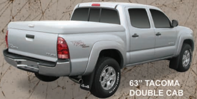
63" TACOMA DOUBLE CAB