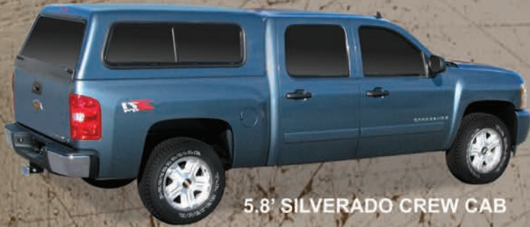
5.8' SILVERADO CREW CAB

Jeraco's Cab-High Series offers truck owners a sleek contemporary designed truck cap built to the same high standards as the rest of Jeraco's products. This time-tested model is the toughest fiberglass cab-high truck cap available. When combined with the impressive array of factory-installed accessories offered by Jeraco the Cab-High Series can be fully customized to meet all your needs.