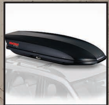
Yakima SkyBox 16 Luggage Carrier