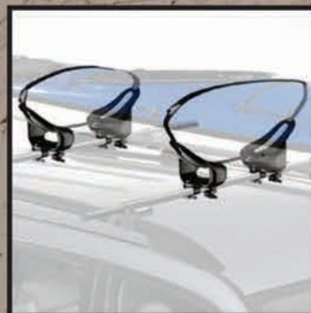
Yakima Mako Saddles Kayak Rack