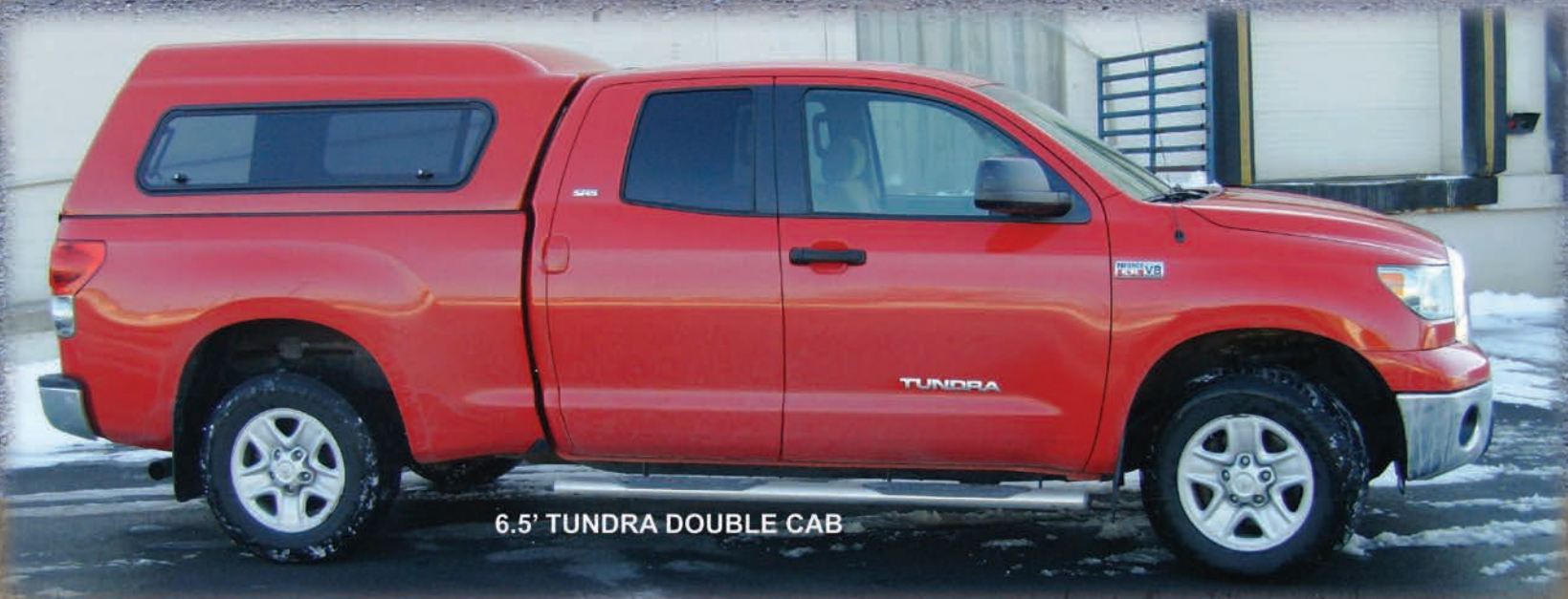
6.5' TUNDRA DOUBLE CAB