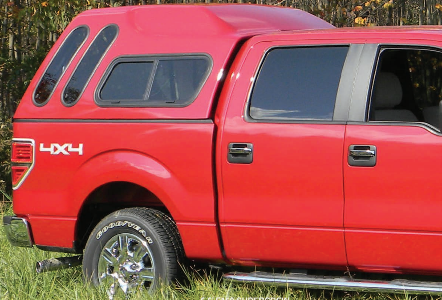
5.5 F150 SUPERCREW

For nearly 40 years Jeraco Enterprises has been manufacturing the highest-quality truck caps available. Our manufacturing processes and only use quality components that not only meet but surpass industry standards.