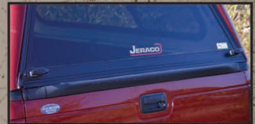
2008+ FORD SUPER DUTY FIBERGLASS DOOR SHROUD