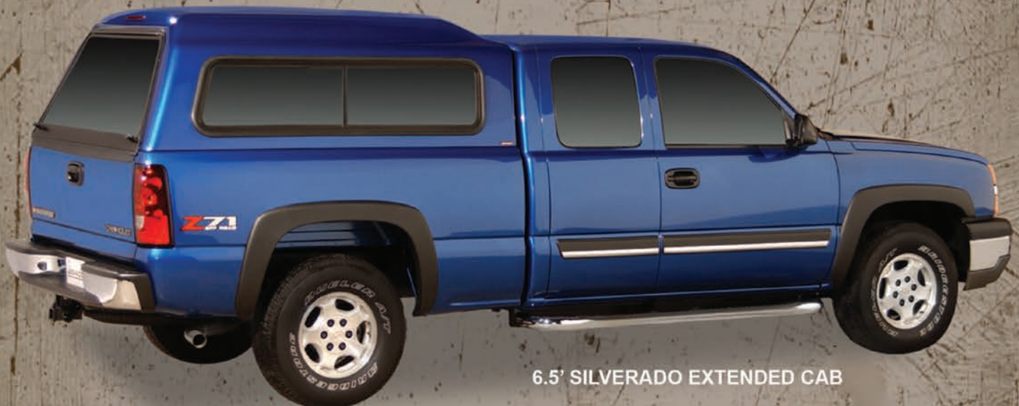
6.5' SILVERADO EXTENDED CAB