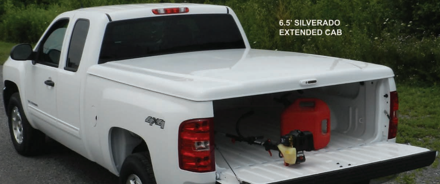
6.5' SILVERADO EXTENDED CAB

Our newest product line, Sport Lid SL fiberglass tonneau covers are based on our Sport Lid Series but feature an added style line to the top of the cover. The Sport Lid SL comes standard with our painted palm operating handle and rod and cam locking system that is found in our Sport Lid Series.