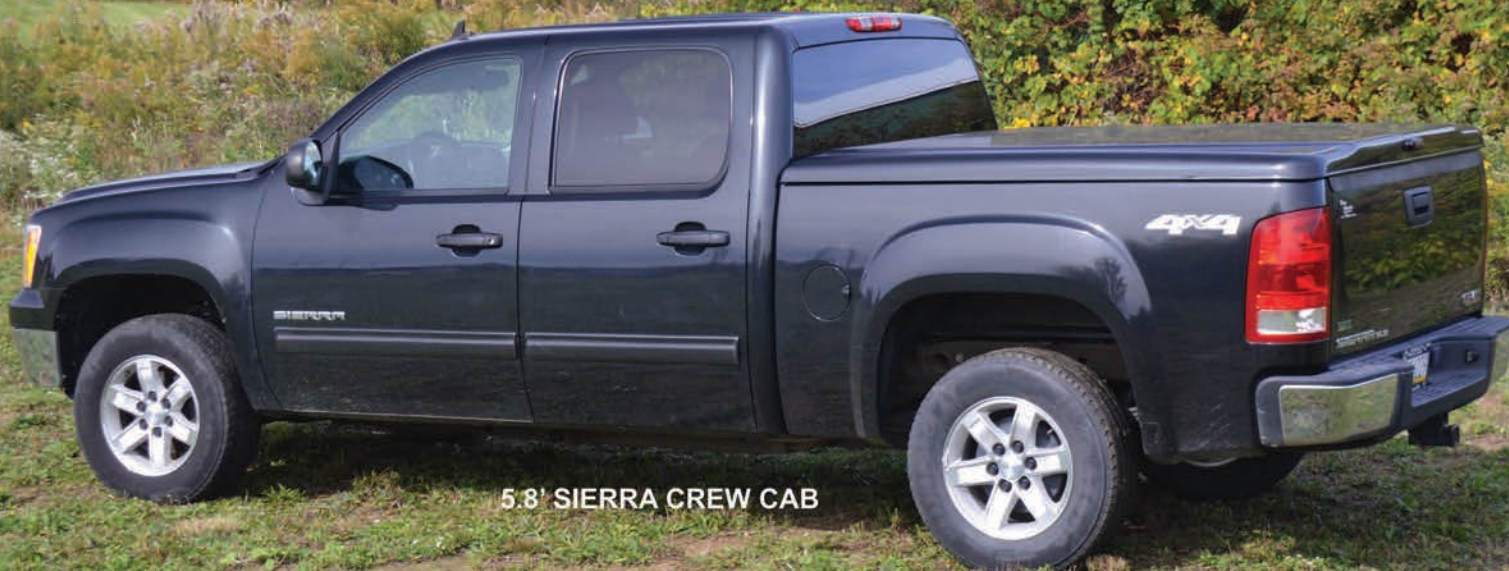
5.8' SIERRA CREW CAB