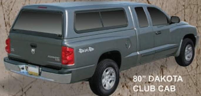
80" DAKOTA CLUB CAB