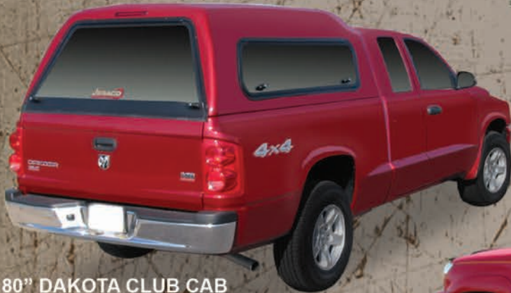
80" DAKOTA CLUB CAB