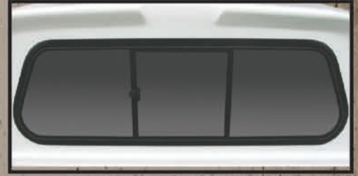
FRONT SLIDING WINDOW