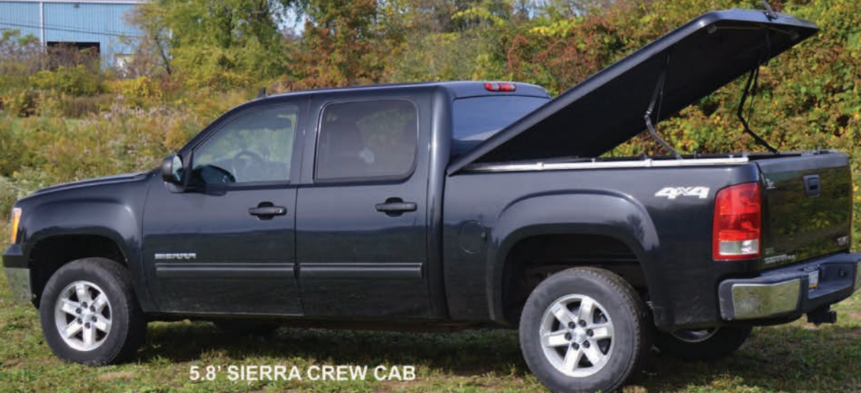
5.8' SIERRA CREW CAB