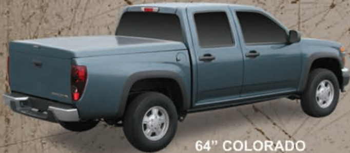
64" COLORADO CREW CAB

Constructed to the same high standards as our fiberglass truck caps, these stylish tonneau covers are custom designed by hand to fit your truck. Key features include a Jeraco exclusive painted handle for easy opening, a locking rod latch system that is many times more durable than cable latching systems and lift assist arms that allow you to easily open and close your Sport Lid.