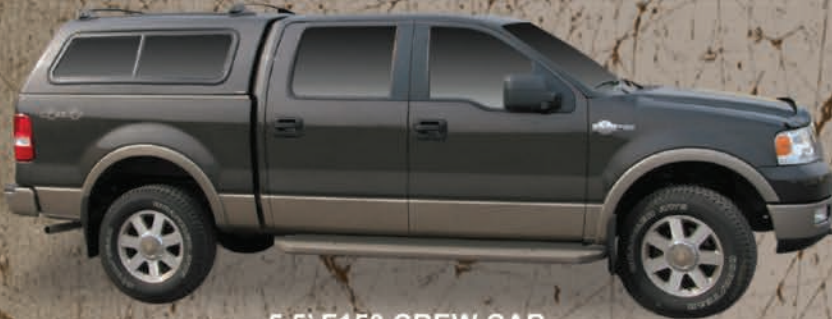
5.5' F150 CREW CAB