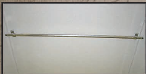
ALUMINUM CLOTHES ROD