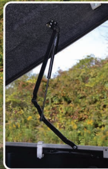
SPORT LID LIFT- ASSIST SYSTEM