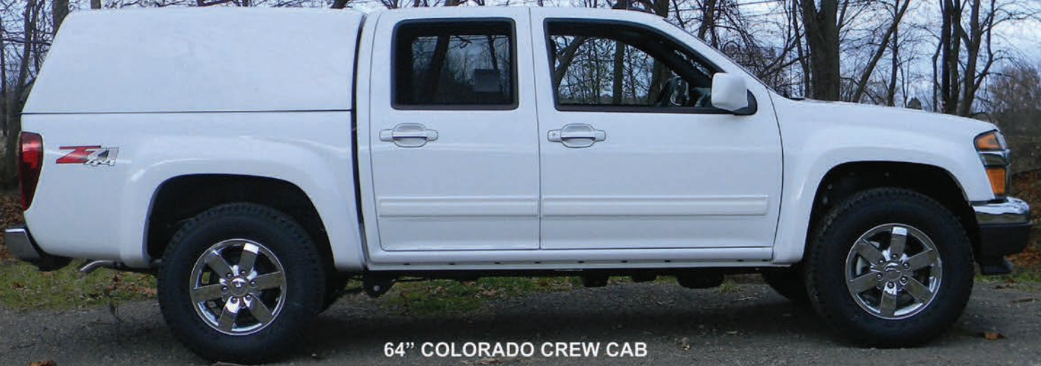
64" COLORADO CREW CAB