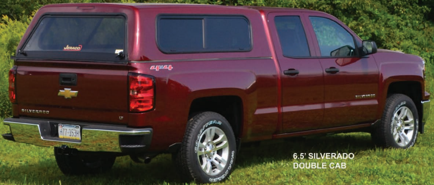
6.5' SILVERADO DOUBLE CAB