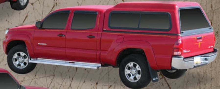
76" TACOMA DOUBLE CAB