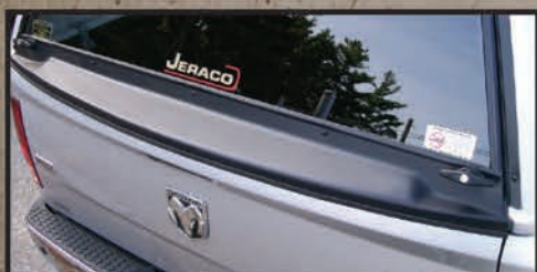
2009+ DODGE RAM FIBERGLASS DOOR SHROUD