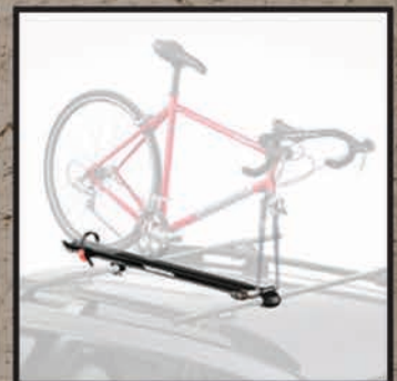
Yakima Copperhead Fork Mount Rack