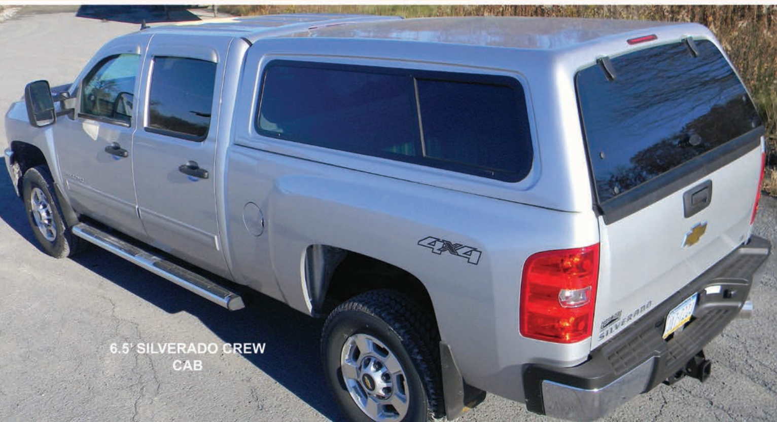
6.5' SILVERADO CREW CAB

Now Available With Optional Side Sliding Radius Windows On Select Models