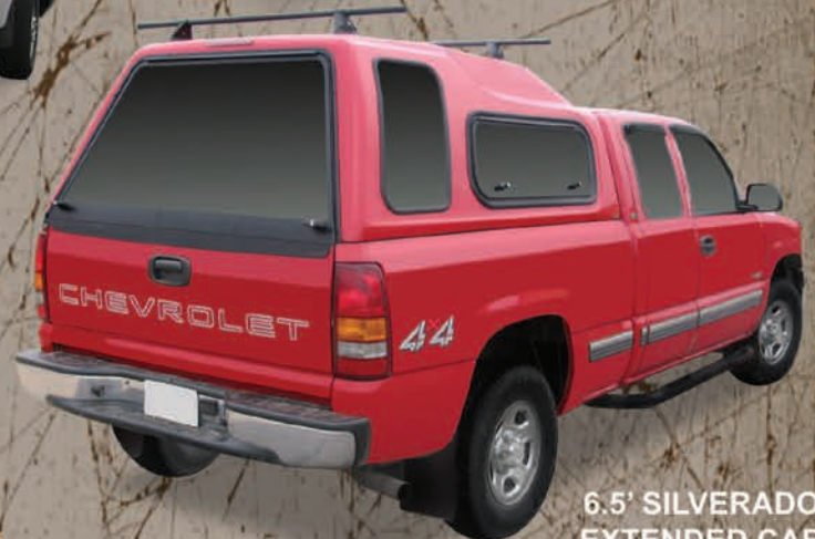
6.5' SILVERADO EXTENDED CAB