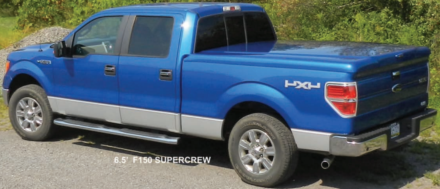
6.5' F150 SUPERCREW