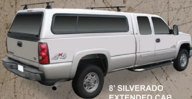
8' SILVERADO EXTENDED CAB