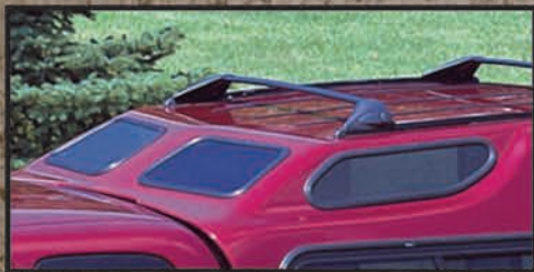
FRONT AND SIDE PORTS