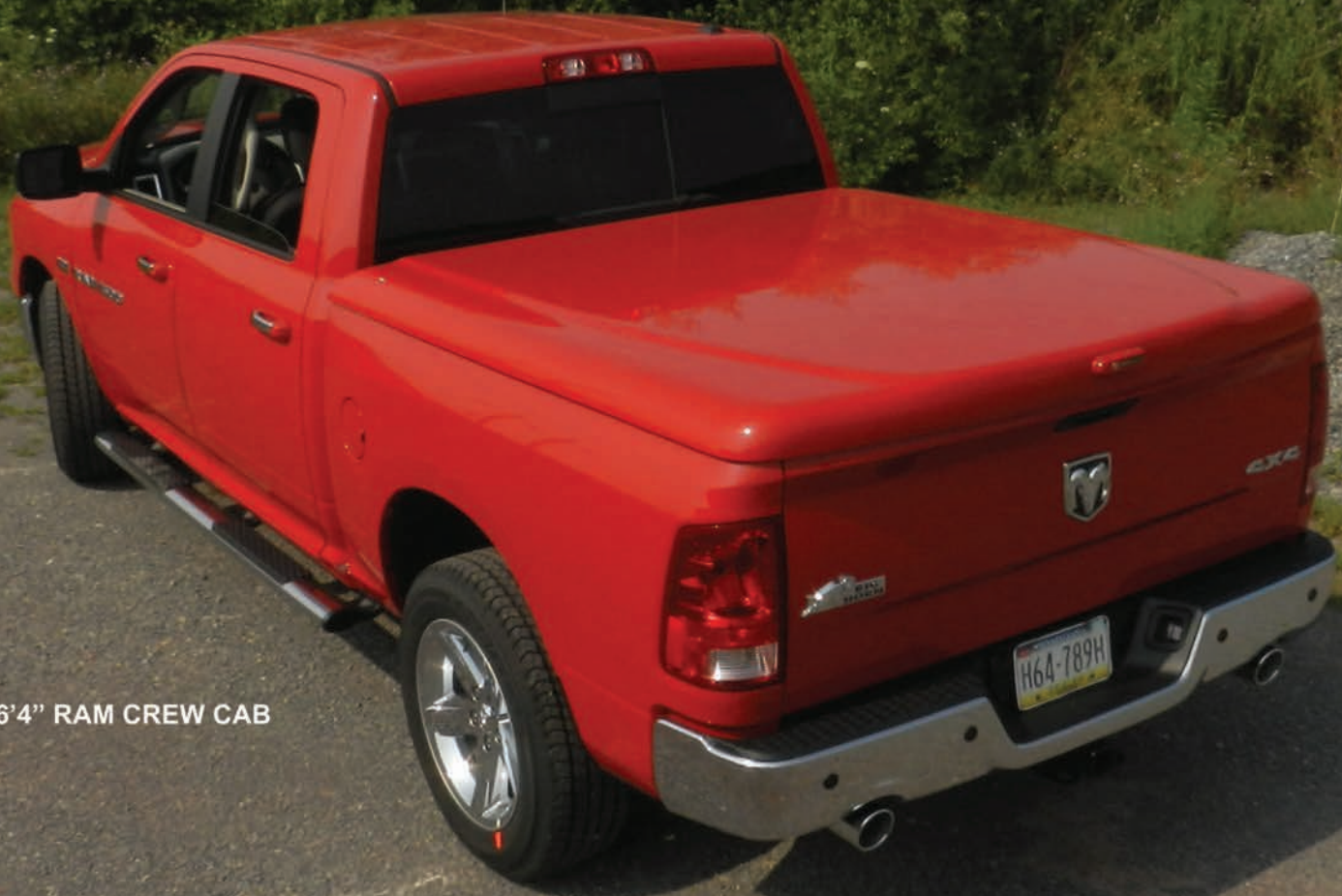
6'4" RAM CREW CAB

Our newest product line, Sport Lid SL fiberglass tonneau covers are based on our Sport Lid Series but feature an added style line to the top of the cover. The Sport Lid SL comes standard with our painted palm operating handle and rod and cam locking system that is found in our Sport Lid Series.