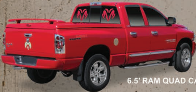
6.5' RAM QUAD CAB