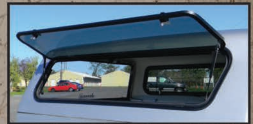
SIDE ACCESS DOOR