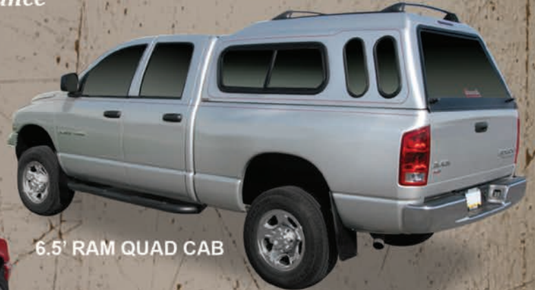
6.5' RAM QUAD CAB

Whether for work or play if you need a cap with extra space the Jeraco Mid-Rise Series has it. With a full size rear door and extra headroom our Mid-Rise truck cap offers superior functionality while still maintaining a sleek sporty appearance