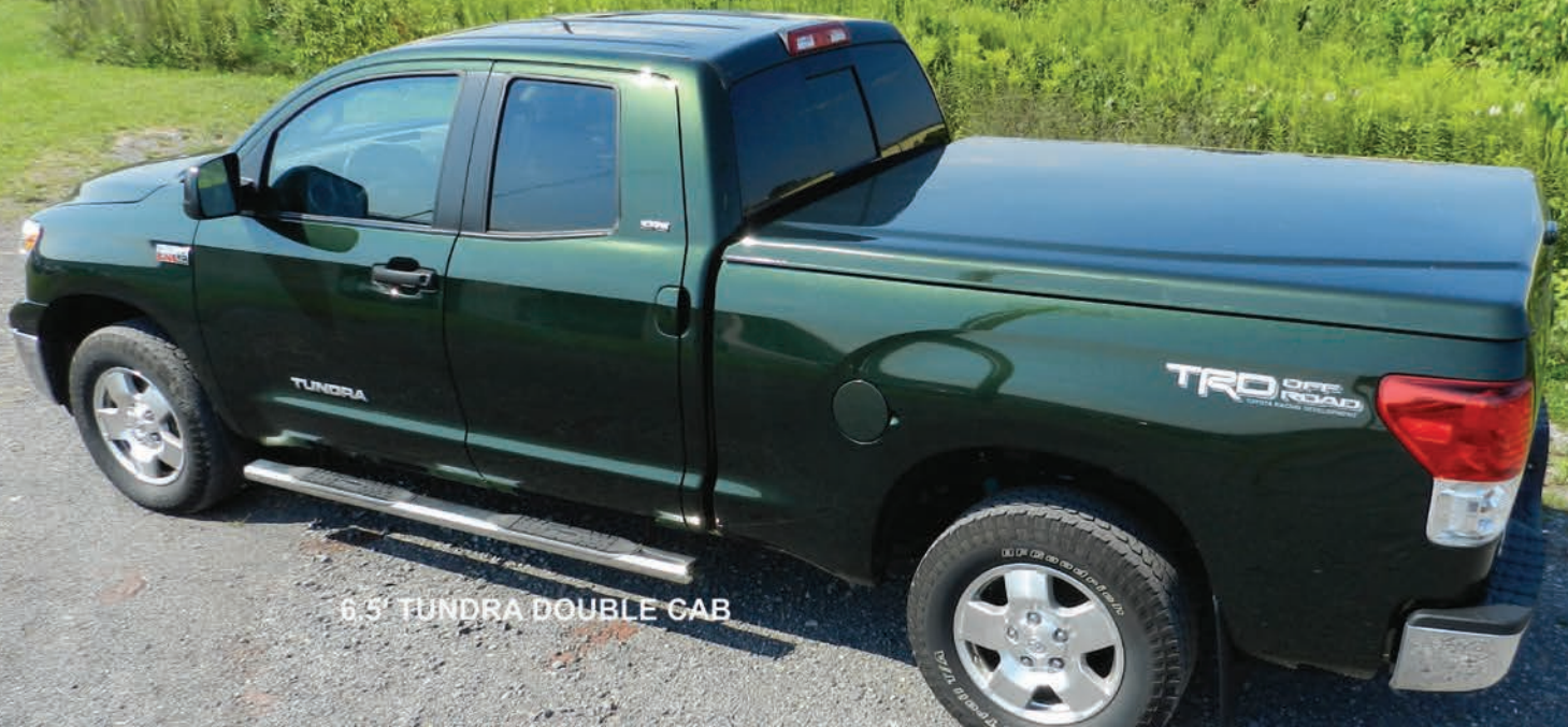
6.5' TUNDRA DOUBLE CAB