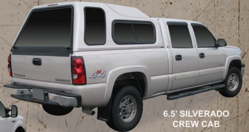
6.5' SILVERADO CREW CAB