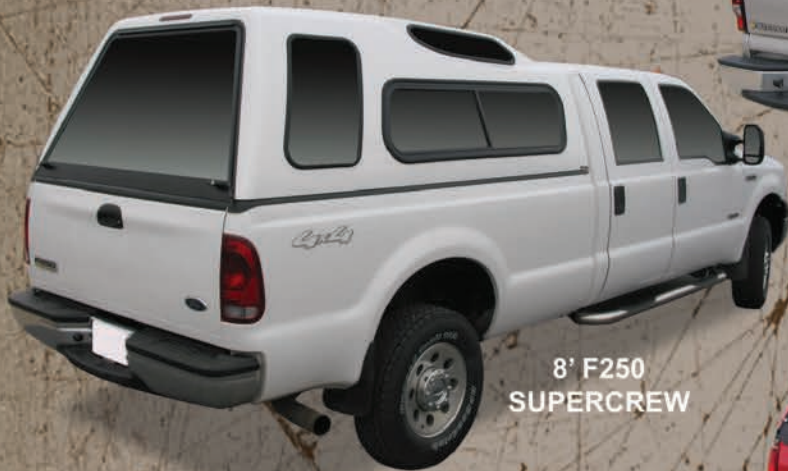
8' F250 SUPERCREW

The High-Rise Series features an oversized rear door for maximum loading capacities, and its aerodynamically designed roof allows your truck to live up to its full cargo potential. Ideal for hunting, camping, or vacationing, the High-Rise Series will suit an array of needs and tastes.