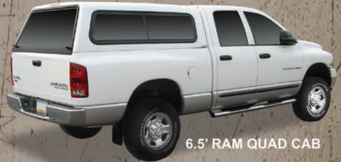
6.5' RAM QUAD CAB