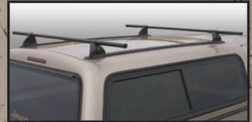
YAKIMA ROOF RACK (AVAILABLE IN ADJUSTABLE OR STATIONARY MODELS)