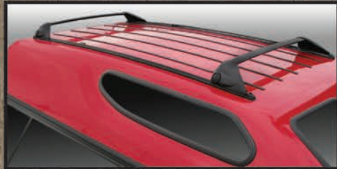
PERRYCRAFT SPORTREK ROOF RACK