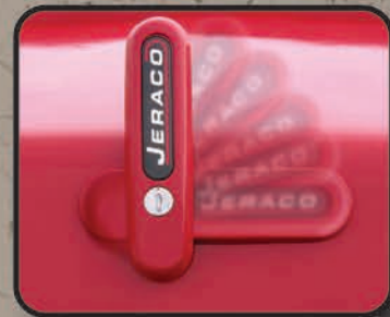
THE JERACO PALM OPERATED HANDLE