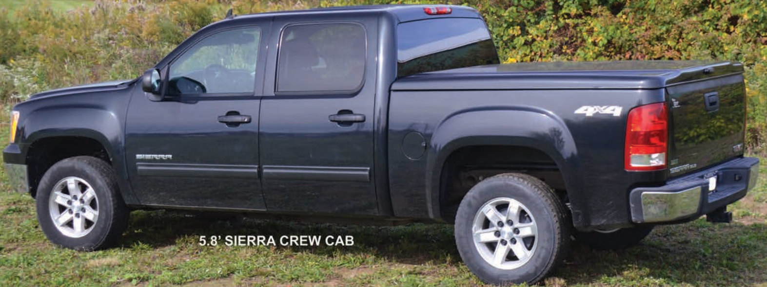
5.8' SIERRA CREW CAB