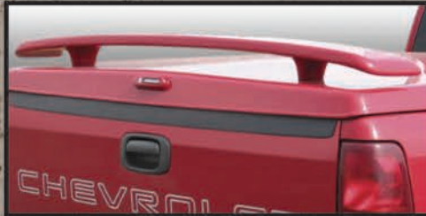
REAR WING RACK